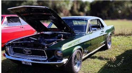
Runner Up Pre 2000's Mustang A Bowlands green 68