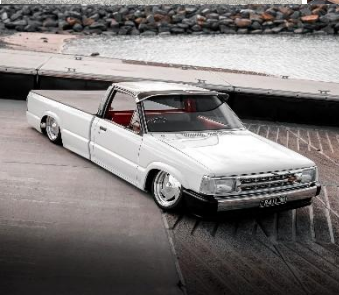
Best Asian- Azzas 1985 Mazda B2000

Proudly Sponsored by Tuff Tyres Gordonvale